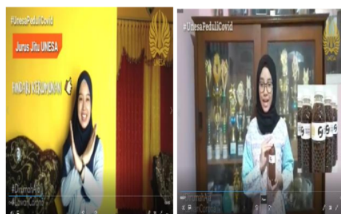
Figure 2 Educational video on healthy lifestyle for the elderly (left: actor 1, right: actor 2)

The second educational material is in the form of a flyer on a healthy lifestyle. The flyer contains messages that are substantially the same as the messages in educational videos to the community / partners, namely 1) avoid crowds and keep your distance, 2) wash your hands frequently, 3) wear masks, 4) get adequate rest, 5) exercise and sunbathe underneath hot sun especially at 06.00-09.00 WIB, 6) consumption of nutritious food and beverages, for example herbal products to increase body antibodies, and 7) being patient, praying and tawakkal (surrender to god) for the maximum effort done.