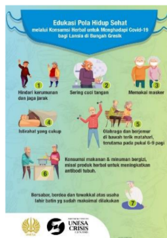
Figure 3 Educational Flyer healthy lifestyle for the elderly